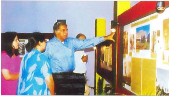
Mr. Ratan N. Tata viewing one of the exhibits at the Jubilee Park, Jamshedpur.

To celebrate Founder's Day on March 3, 2003, Tata Steel for the first time put up an exhibition on "Sir Dorabji Tata and its Philanthropic Institutions" in the Jubilee Park at Jamshedpur. The exhibition showcased the Tata Trusts as being 'universal' in their generosity without any distinction of place, nationality or creed. It was viewed by thousands of citizens who flocked to see Jubilee Park which was transformed into a "fairy-land" of lights.